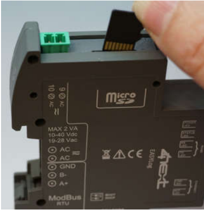
Fig.1 SD Card insertion

The connector is a push-push type: to insert the card, press it until a click is felt. To remove the SD card, press lightly; on click the card will lift a bit and can be withdrawn. N.B. We always recommend the use of industrial-grade SD cards.