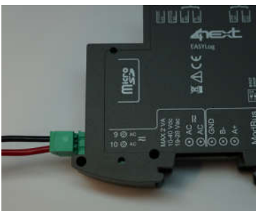
Fig.4 Power supply terminal

Connect EasyLog to a 10-40Vdc / power supply 19-28Vac as in Fig. 4. There is no polarity to be respected.