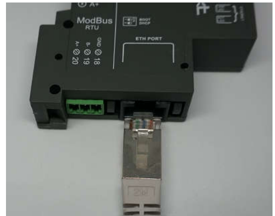
Fig.3 Ethernet connector

If you are using an ethernet connection to read data from ModBus TCP devices, insert the jack of the ethernet cable into the appropriate RJ connector of the EasyLog, as shown in Fig.3.