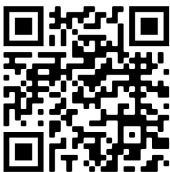
Easylog WEB page

The following QR code gets you stright to Easylog manual and web page.