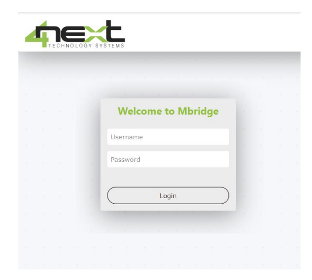
Fig.5 Login browser screen

For more information, the complete manual and other documentation are available on our website <a href="https://www.4next.eu">www.4next.eu</a>.